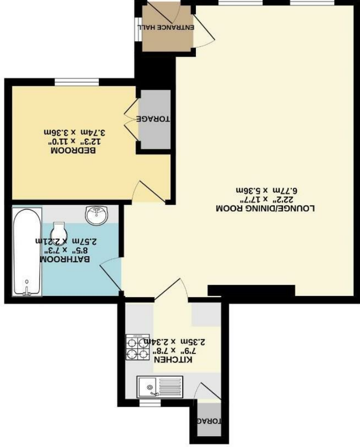
GROUND FLOOR 574 sq.ft. (53.4 sq.m.) approx.

While every attempt has been made to ensure the accuracy of the layout contained here, measurements of doors, windows, rooms and any other items are approximate and no responsibility is taken for any error. Prospective purchasers should verify all measurements and specifications shown here and should be used as such by any prospective purchaser. This plan is for illustrative purposes only and should be used as such by any prospective purchaser. The services, options and appliances shown here are not guaranteed and no guarantee as to their operability or efficiency can be given. Made with Metriplex ©2023